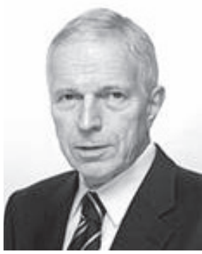
Edmund Phelps Columbia University Center on Capitalism & Society Nobel Prize, Economics (2006)