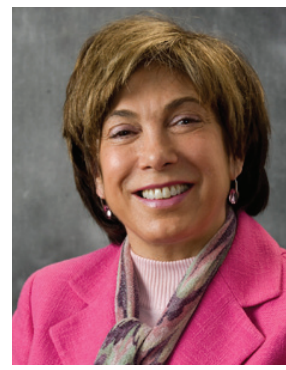
Laura Tyson Professor, Haas School of Business, University of California Berkeley

IN COLLABORATION WITH | The New York Times