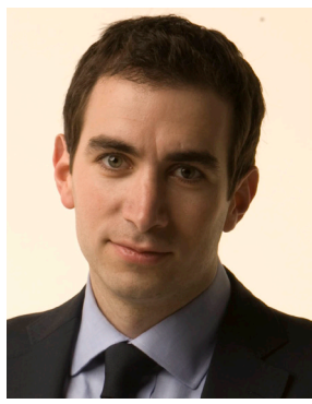
Andrew Ross Sorkin New York Times Chief Mergers and Acquisitions Reporter